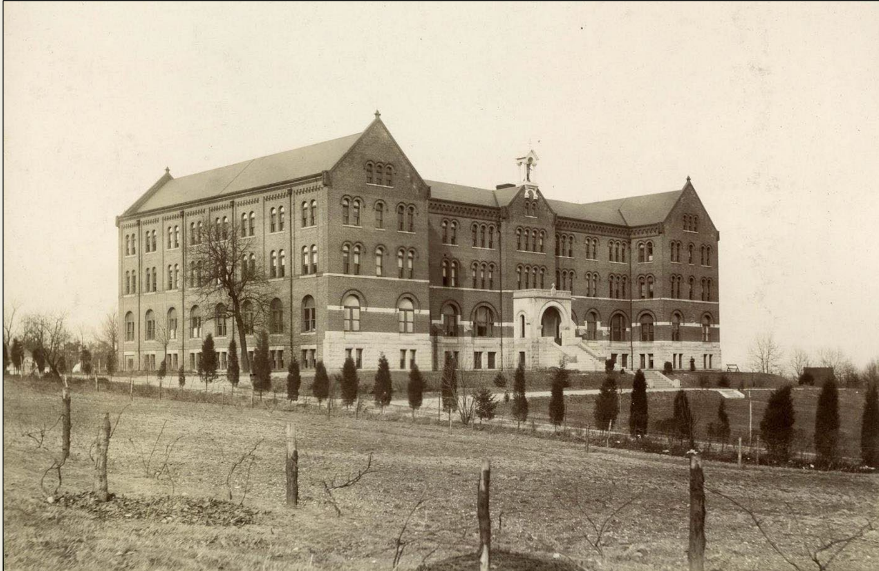
Marist College from the southwest, around the time of its construction in 1900 (Special Collections, CUA).