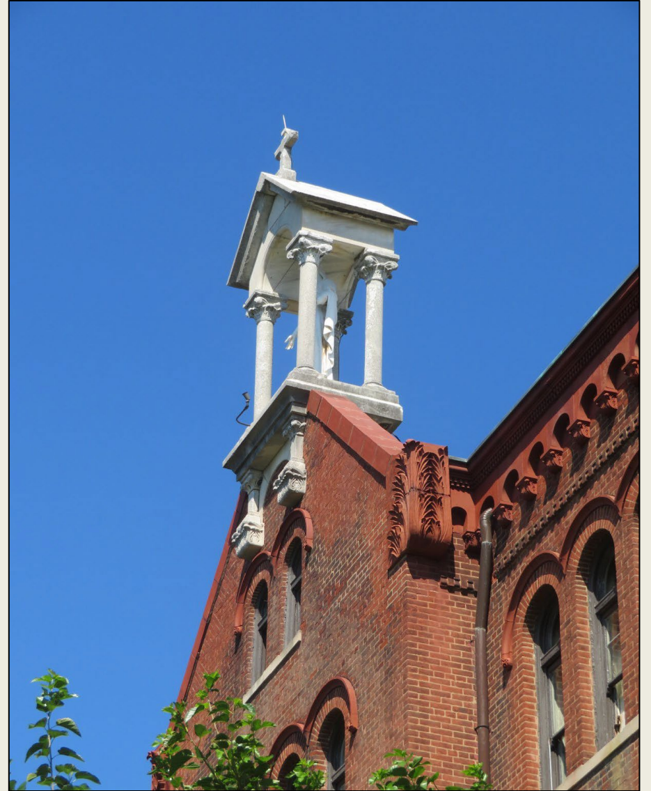
Detail of Tabernacle (DeFerrari, 2022).