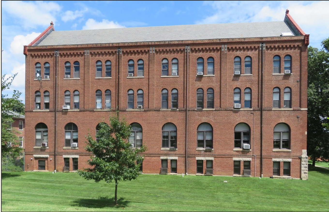
West Elevation (DeFerrari, 2022).