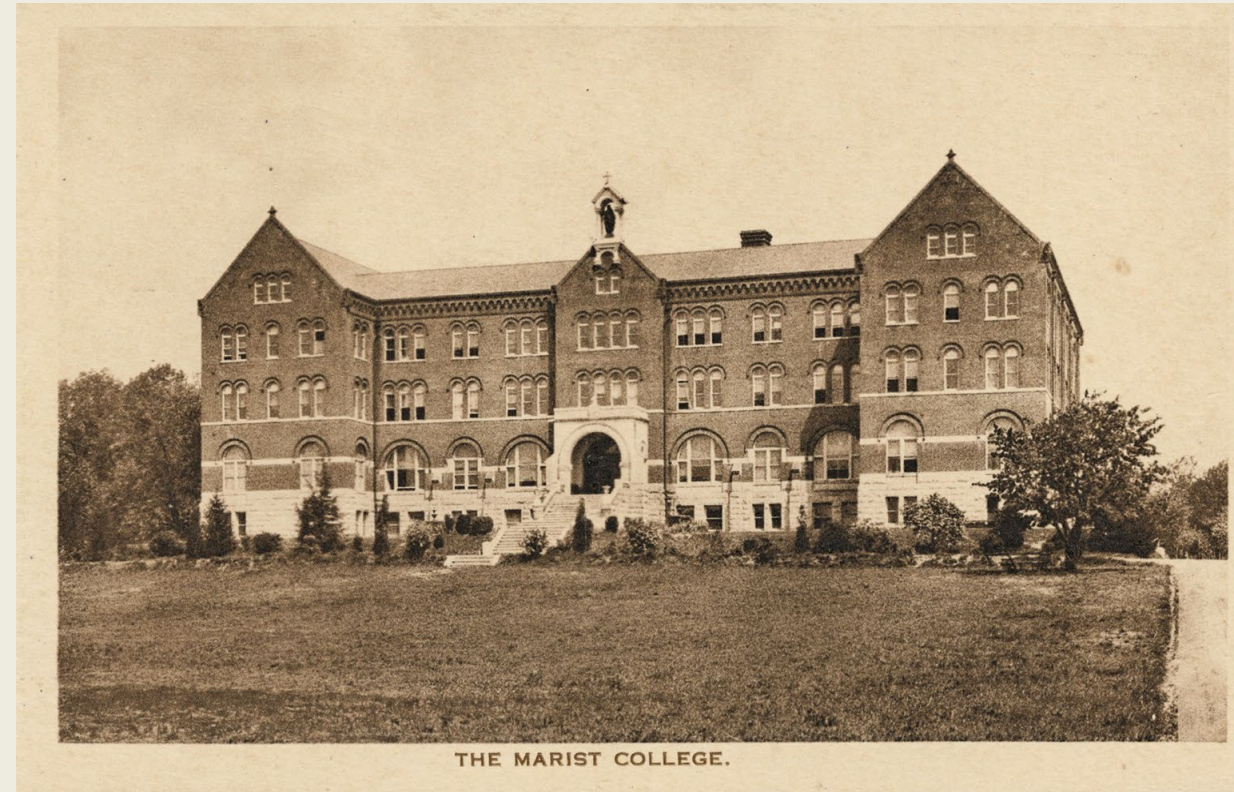
Undated Postcard View of Primary Façade.