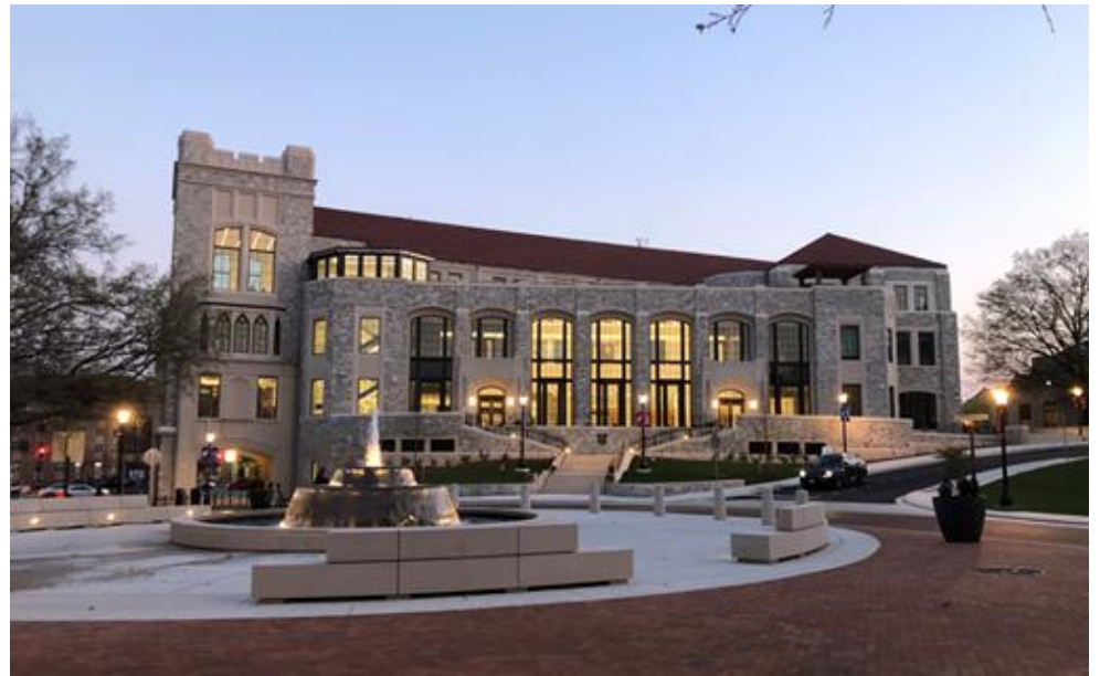
Conway School of Nursing 2024