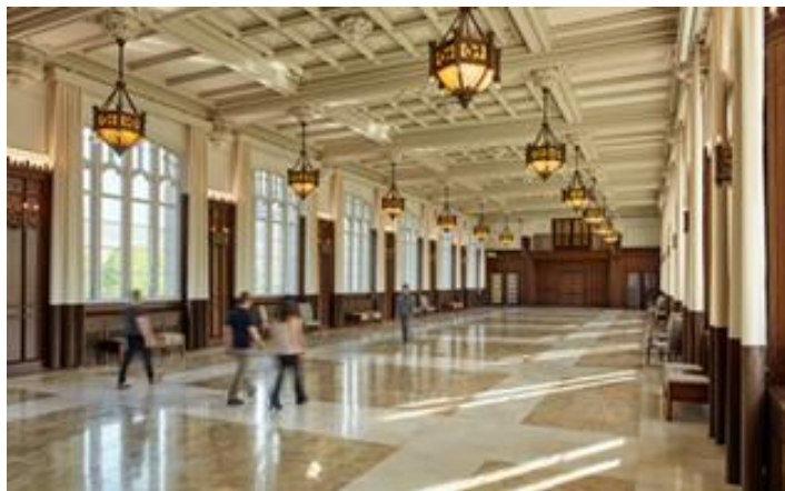
Heritage Hall space in Father O'Connell Hall