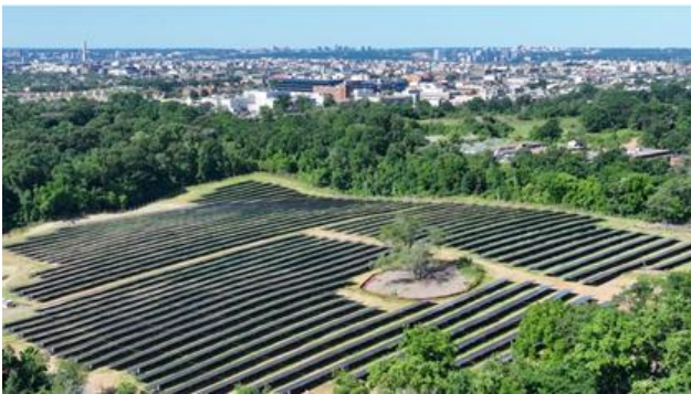
West Campus Solar Array, 2024