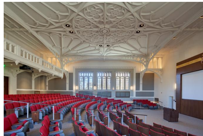
Della Ratta Auditorium in Maloney Hall