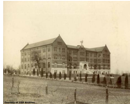
Marist Hall, 1900

Location of Marist Hall (outside University property lines in 1939)