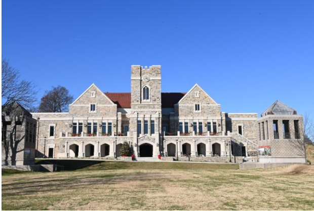
Garvey Hall Dining Commons, 2022