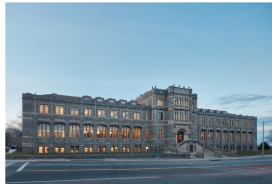
Maloney Hall, originally constructed 1917, major renovation 2017-2019