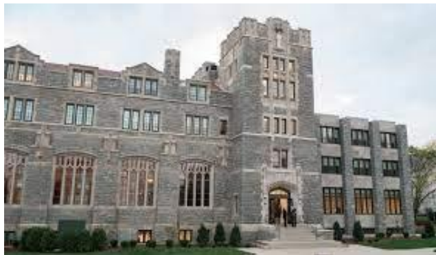
Father O'Connell Hall, originally constructed 1914, major renovation 2013-2015