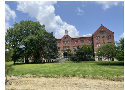
Marist Hall, 2025