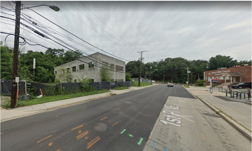
3 SW corner at 1st Place