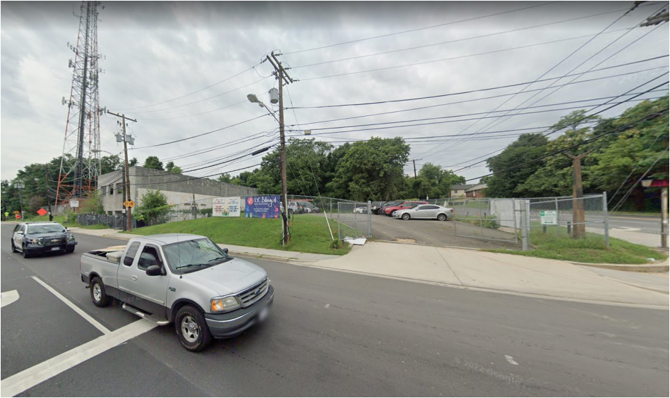
2 W face of site at 1st Place