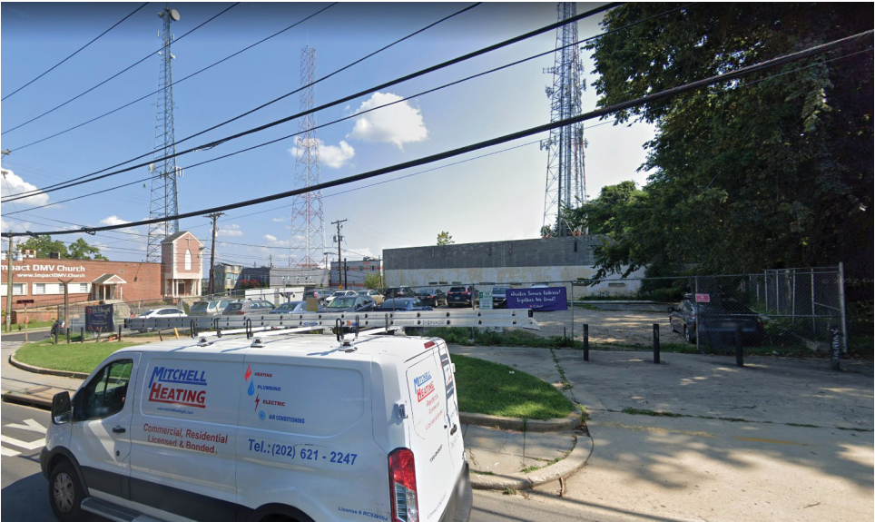
5 N face of site at Riggs Rd