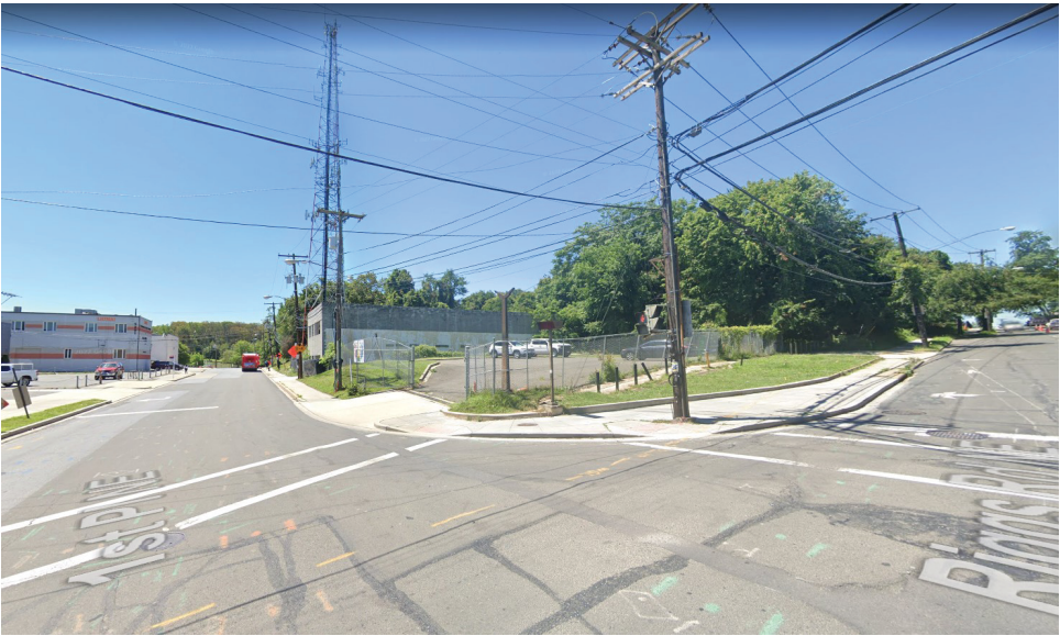
1 NW Corner at 1st Place and Riggs Rd