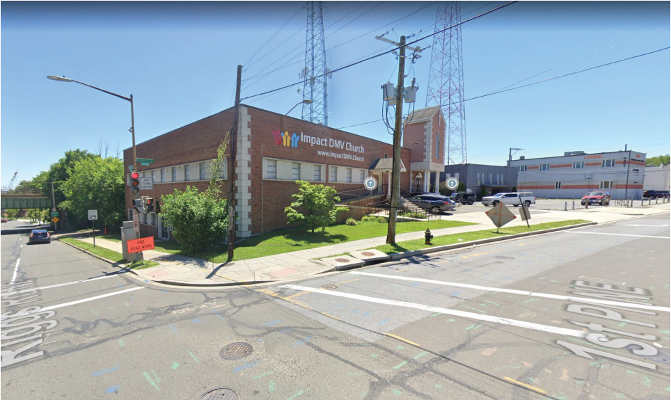
4 Exist Church at 1st Place and Riggs Rd