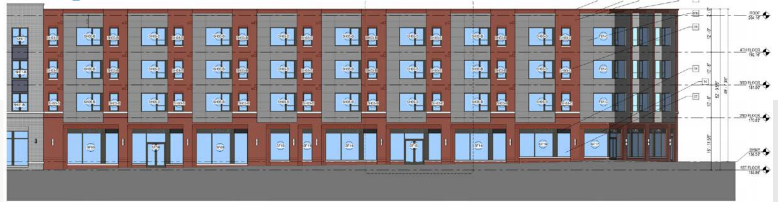
A3 WEST ELEVATION 2 - RIGGS RD NE 1/8" = 1'-0"