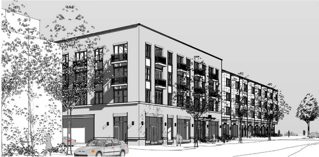
VIEW ALONG RIGGS RD, NE AT ENTRANCE TO PRIVATE ROAD