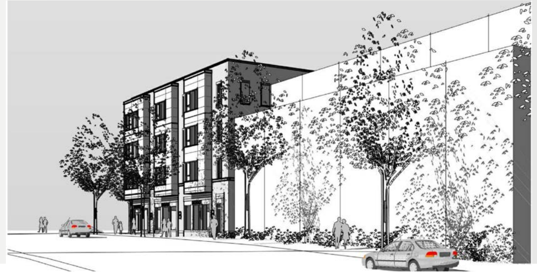
VIEW ALONG SOUTH DAKOTA AVENUE, NE