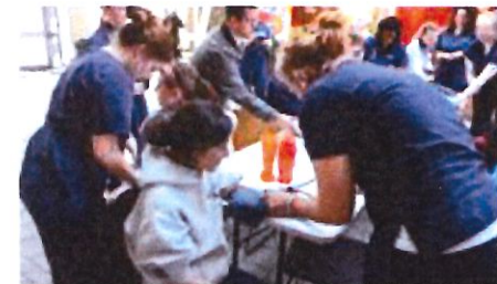
Catholic University Student Health Services Clinic