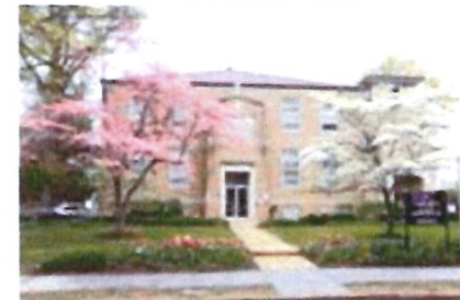
DC Police and Fire Clinic (Clinic services)