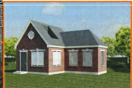
New South Ventilation House