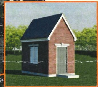
New North Ventilation House